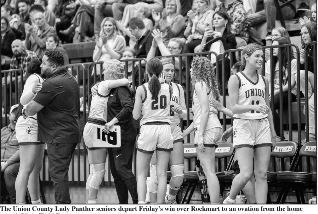
The Union County Lady Panther seniors depart Friday's win over Rockmart to an ovation from the home crowd.

"Coahulla has a bunch of solid girls that average about 8-9 points a game. We have to run them off the 3-point line and rebound if we want to keep on playing into the weekend."